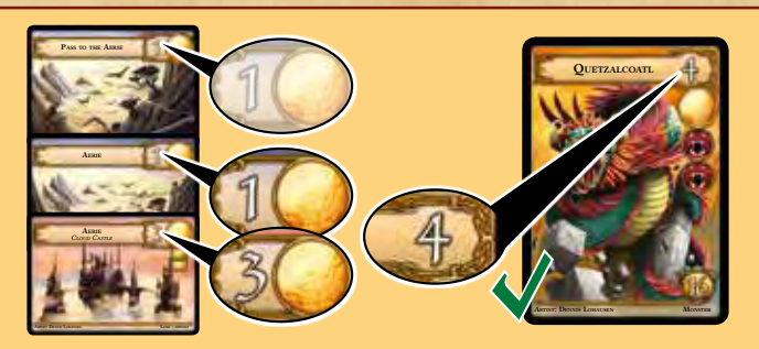
Example: Nene wants to play her Level 4 Quetzalcoatl. Fortunately, she has two regular Aerie Land Cards and a Cloud Castle (worth 3 Aerie Land Points), which provide her enough Aerie Land Points to display the magnificent Quetzalcoatl.

In order to play a Monster Card, you must spend Land Points from matching Land Cards. The number of Land Points you must spend is equal to the Monster's Level, shown in the top corner of the card. If you have enough Land Points, you can place the Monster Card face up in front of you.